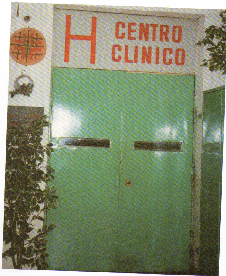
The entrance to the Penitentiary Hospital