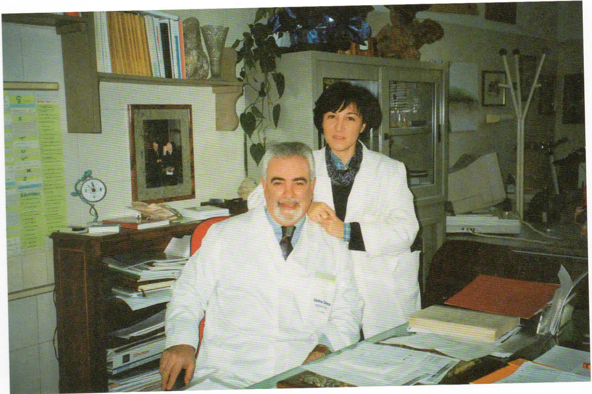
The doctors of the Penitentiary Hospital