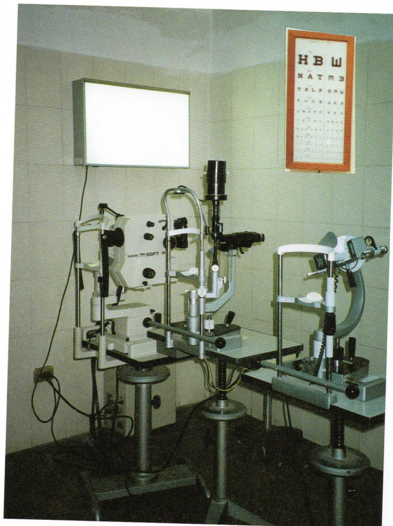
Eye surgery ambulatory