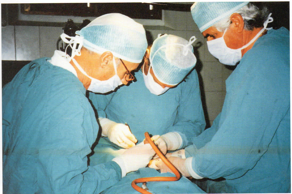
A Plastic-surgery operation